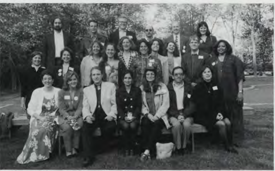
The Class of 1972 at their 25th reunion.