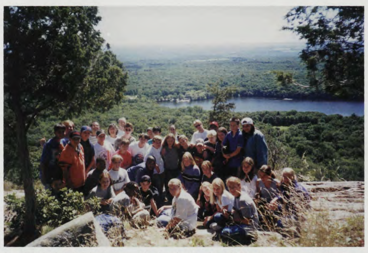
Seventh graders kicked off the school year with a three-day trip to beautiful Fairview Lake in northern New Jersey. The experience is designed to bring the class together through team projects and provide learning opportunities in the field that relate to their study of history, English and ecology.