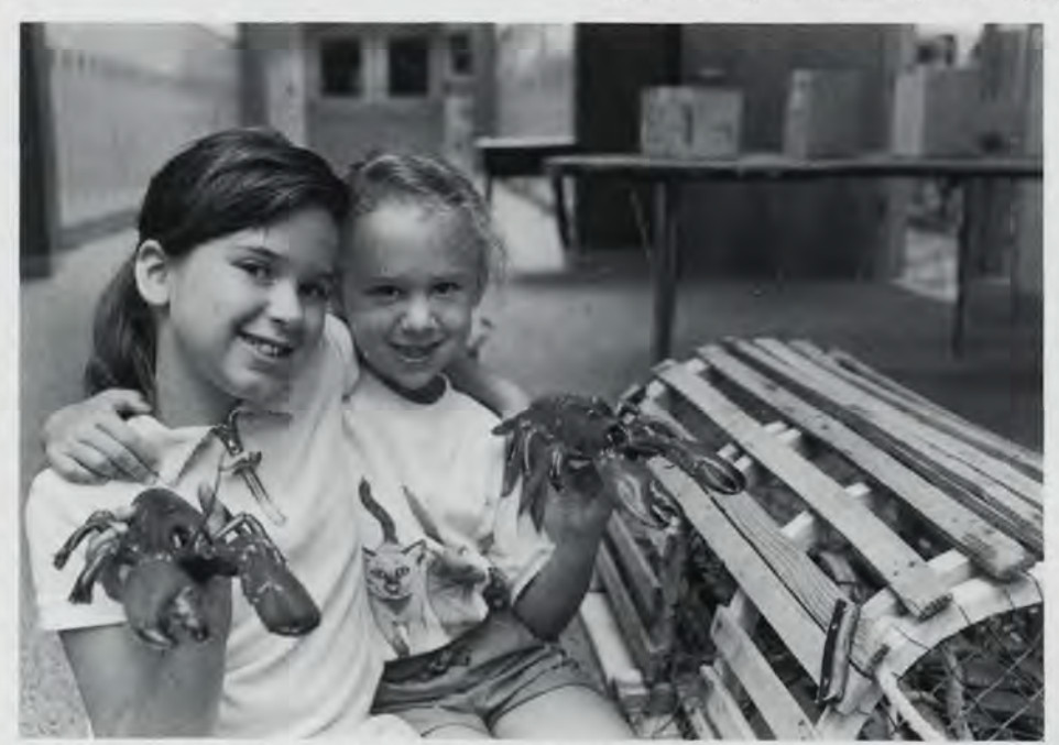
Summer camp friends show off lobsters they studied in a language arts and math course entitled Under the Sea and Around the World.

Ten students currently attend PDS thanks to the New Jersey SEEDS program which provides educational opportunities for highly motivated, academically qualified students in financial need. The goal of the organization is to pre-