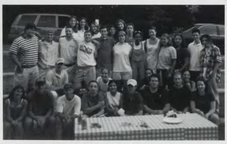
In August members of the Class of '97 gathered for their "Last Hurrah" cookout before going off to college. The event, sponsored and staffed by the Alumni Association, gives students a chance to share their summer experiences and exchange college addresses.